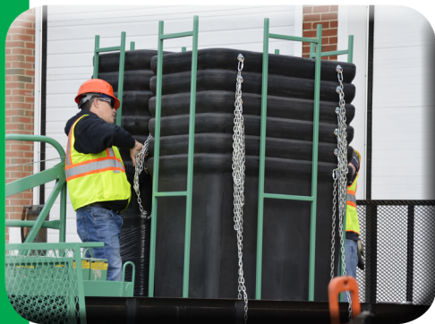
Optional chute rack holds (6) chutes