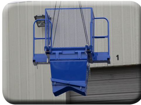
Pro Swivel Hopper allows filling of 2 cans without repositioning