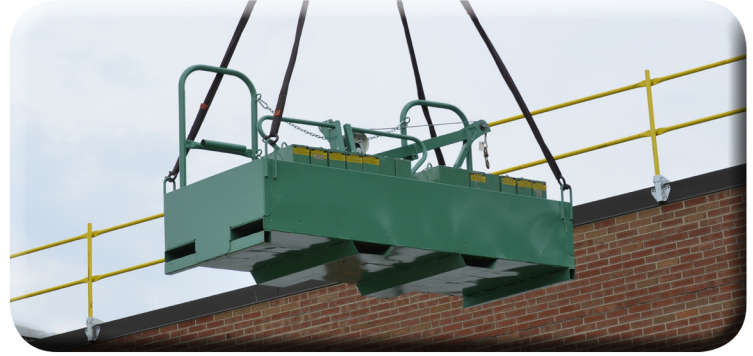
Pick Box keeps your system organized and simplifies installation.