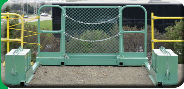
Large loading zone allows direct dumping into hopper. Integrated rails and hopper fences standard.