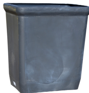
One Piece molded for Durability