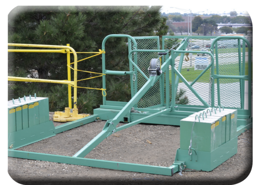
Optional hand hoist aids installation of chutes